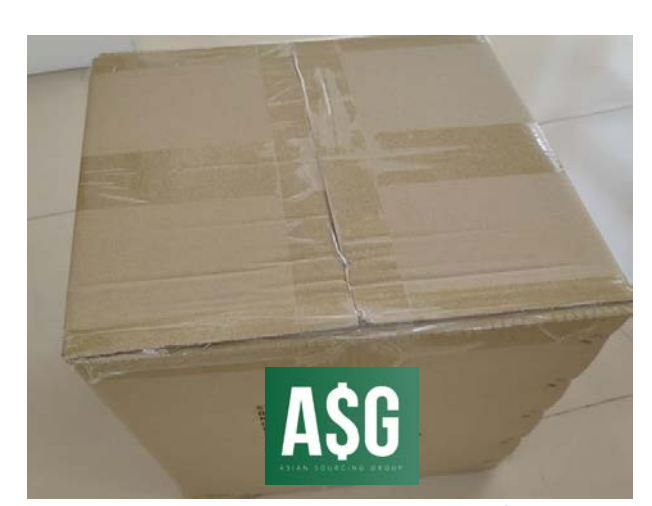
002 master carton view