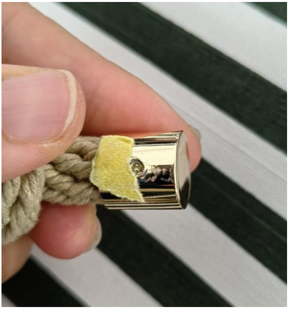
027- defect-metal scratch on surface