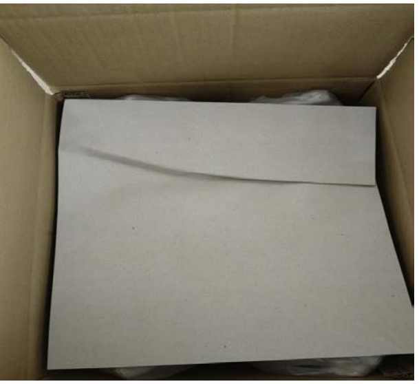
004 packed into carton