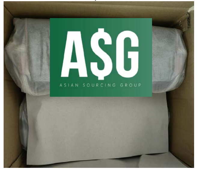
The results reflect our findings at time and place of inspection. This report does not relieve sellers/manufacturers from their contractual liabilities or prejudice buyers' right for compensation for any apparent and/or hidden defects, not detected during our random inspection or occurring thereafter. This report does not evidence shipment.