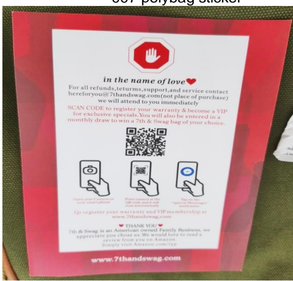
009 instruction card