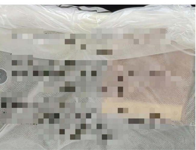
008 polybag marking