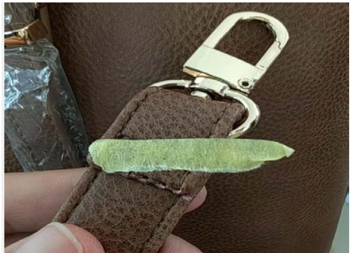
024- defect-pu damage on surface