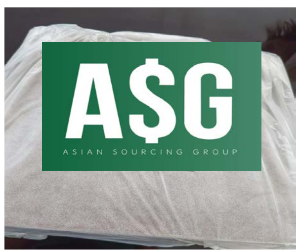
008 polybag marking