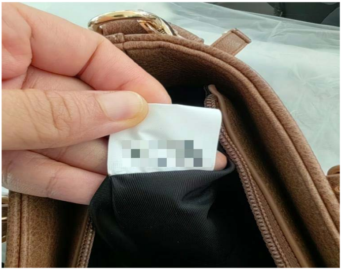
018 composition label