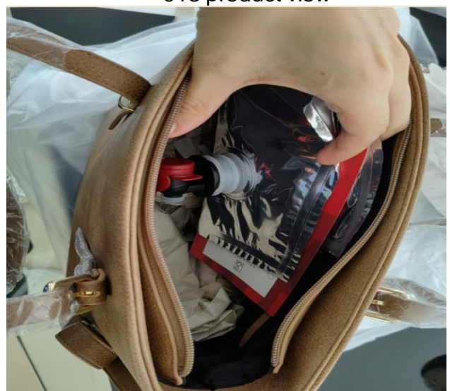
015 product view