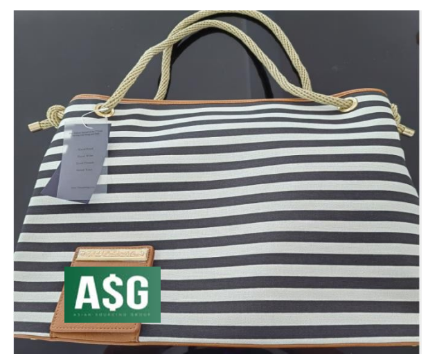
013 product view