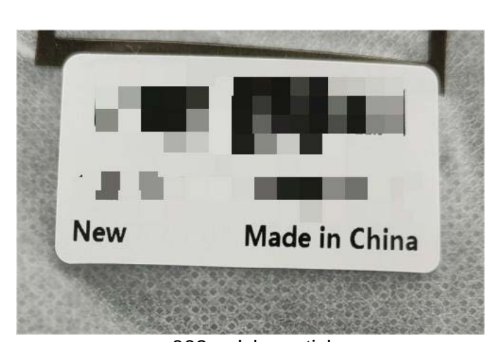
009 polybag sticker