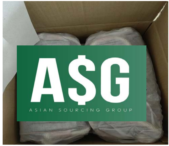
004 packed into carton