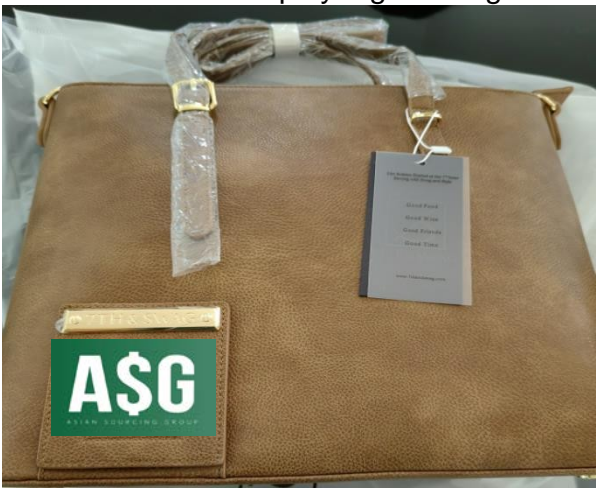
010 unit packing