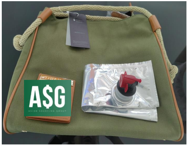
021 casual -green