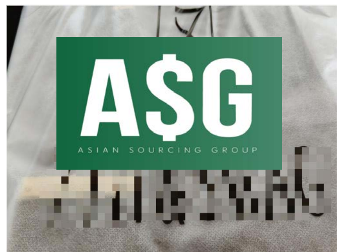
007 polybag marking