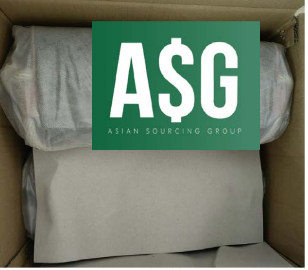
006 packed into carton

THE RESULTS REFLECT OUR FINDINGS AT TIME AND PLACE OF INSPECTION. THIS REPORT DOES NOT RELIEVE SELLERS/MANUFACTURERS FROM THEIR CONTRACTUAL LIABILITIES OR PREJUDICE BUYERS' RIGHT FOR COMPENSATION FOR ANY APPARENT AND/OR HIDDEN DEFECTS NOT DETECTED DURING OUR RANDOM INSPECTION OR OCCURRING THEREAFTER. THIS DEPORT DOES NOT EVIDENCE SUIDMENT. REPORT DOES NOT EVIDENCE SHIPMENT.