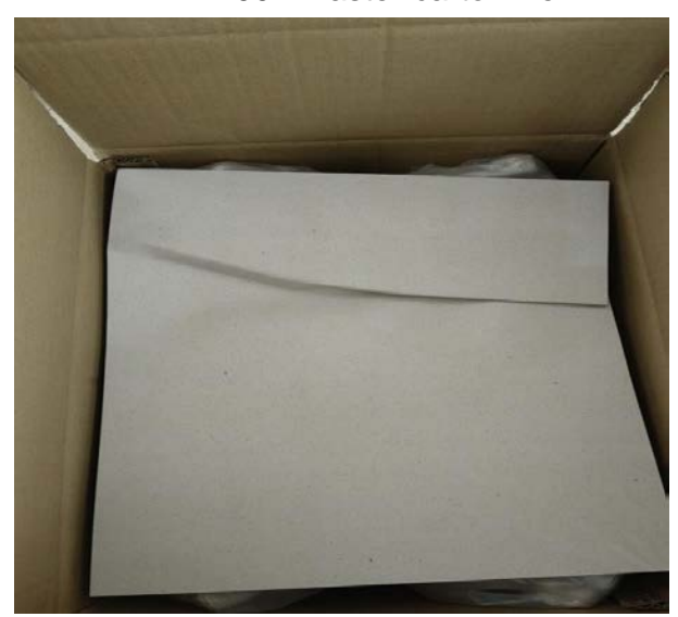
004 packed into carton