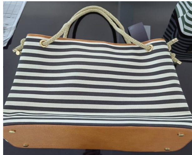
014 product view