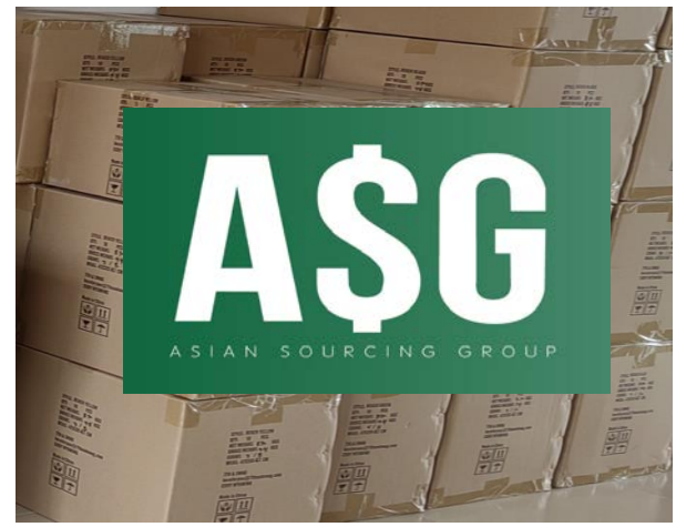
001 goods ready