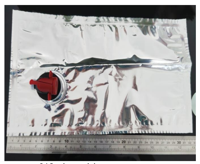
012 wine polybag