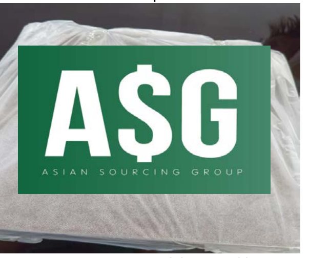
006 polybag marking