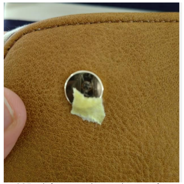
025- defect-metal scratch on surface