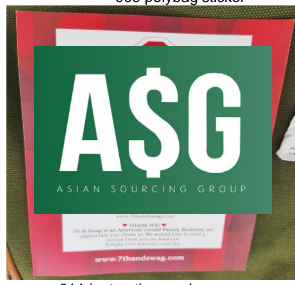
011 instruction card