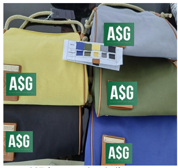
027-factory color clarify