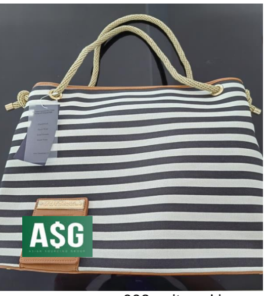
008 unit packing