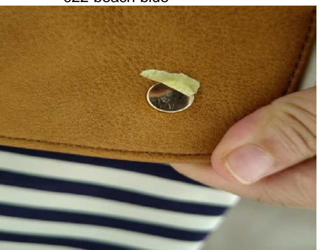
024- defect-metal scratch on surface