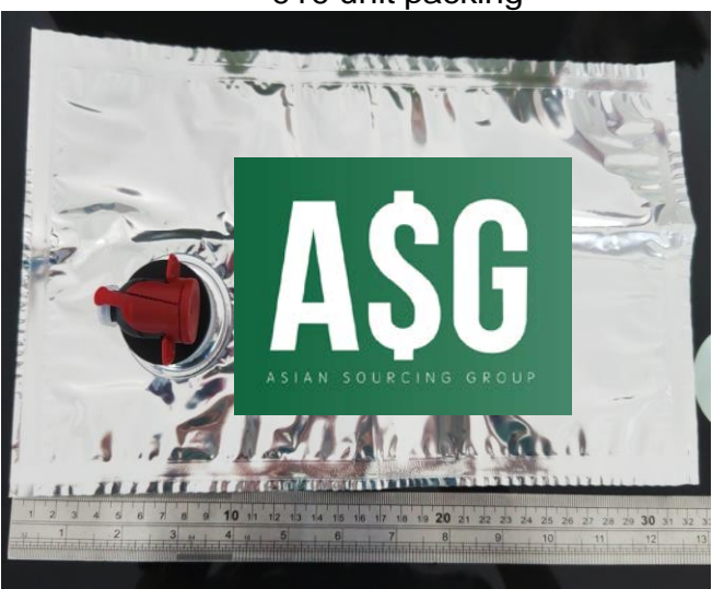
012 wine polybag