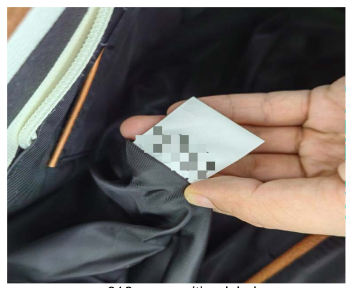
018 composition label