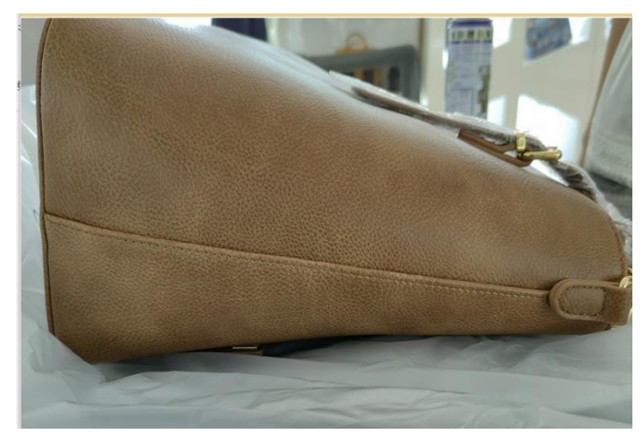
016 product view