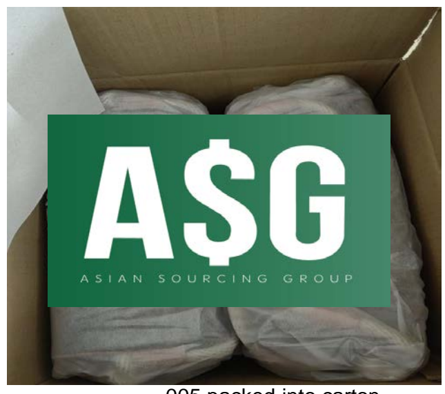
005 packed into carton