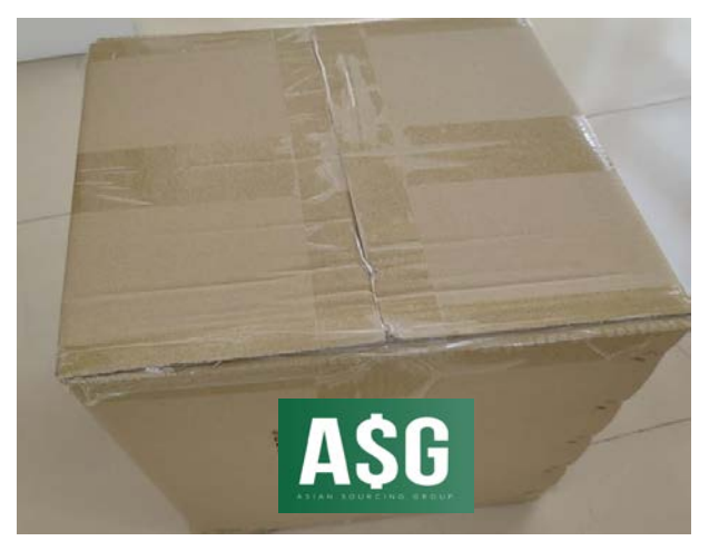
002 master carton view