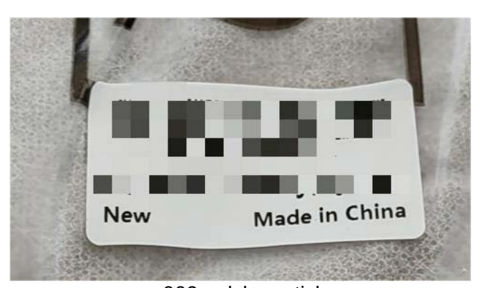
009 polybag sticker