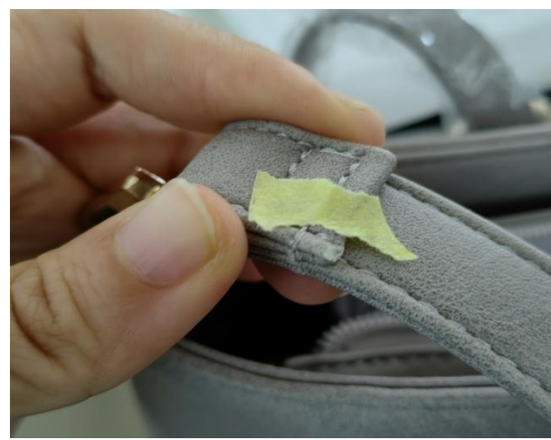
026-defect-pu damage on surface