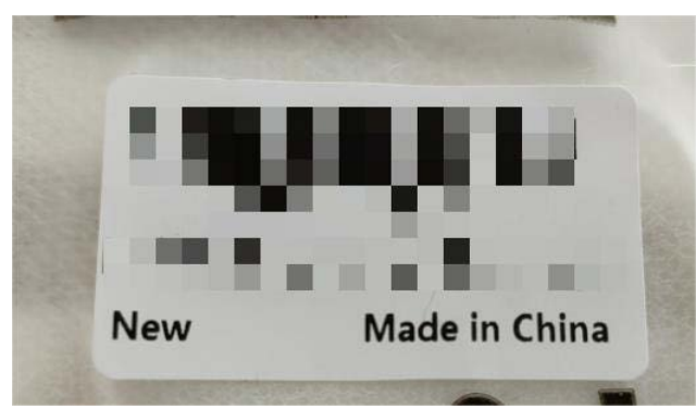
007 polybag sticker