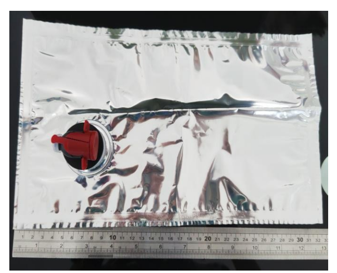
010 wine polybag