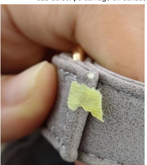
027-defect-pu damage on surface