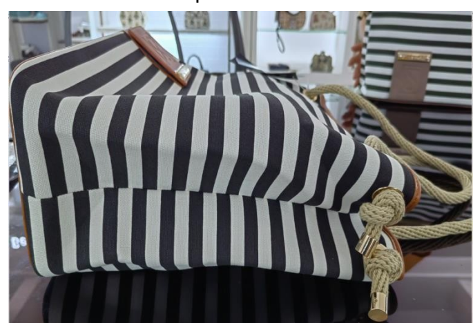
016 product view