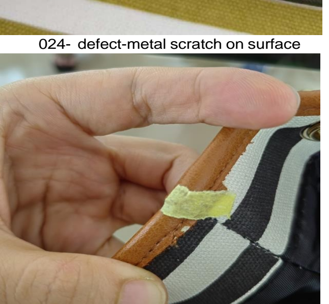
026- pu damage on surface