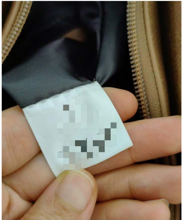
017 composition label