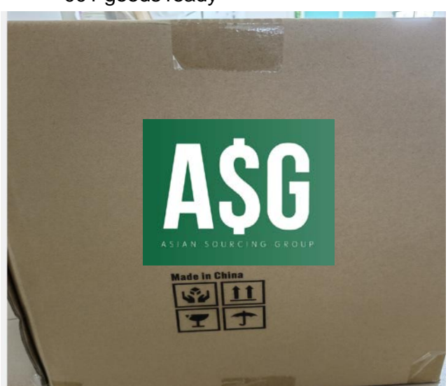
003 carton label