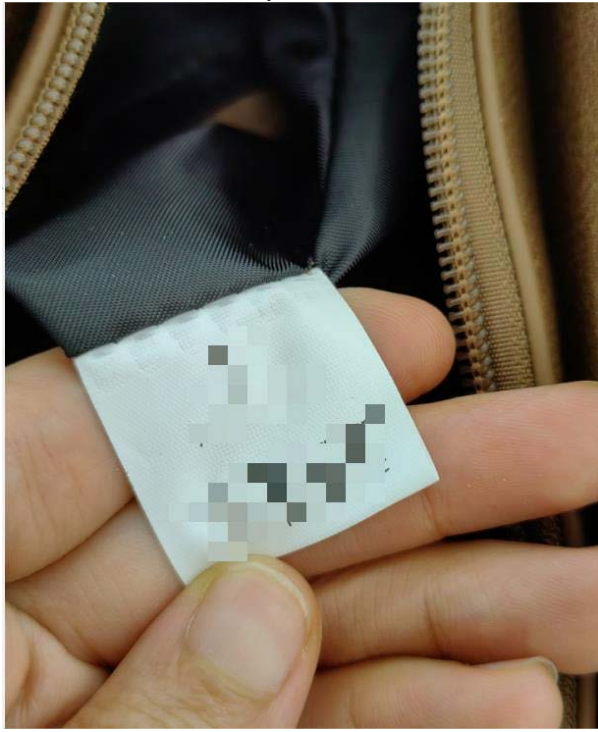
017 composition label