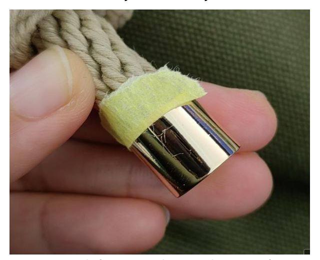
029 - defect-metal scratch on surface-major 030 - defect-magnet without function-major