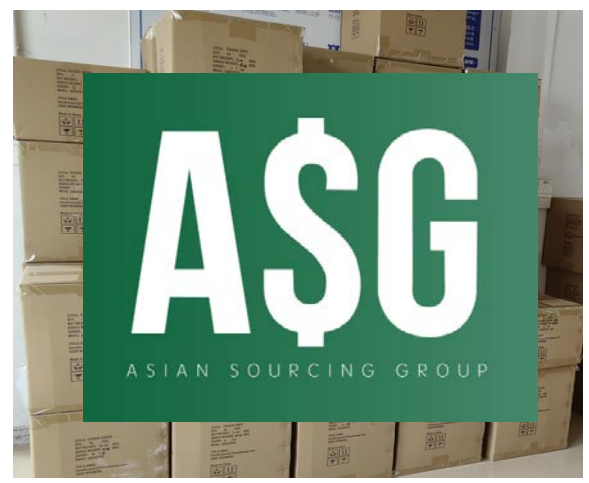
001 goods ready