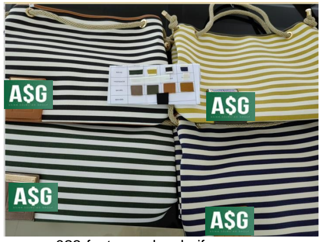
023-factory color clarify