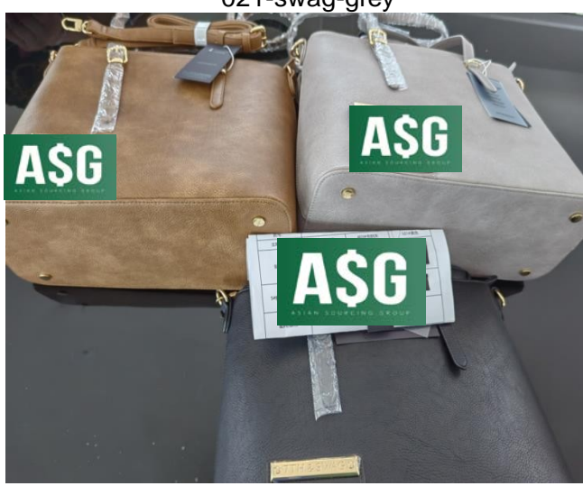
023-factory color clarify