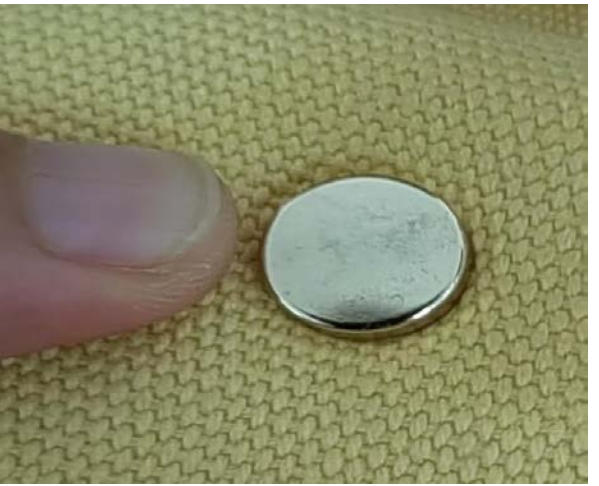
032- defect-scratch on surface