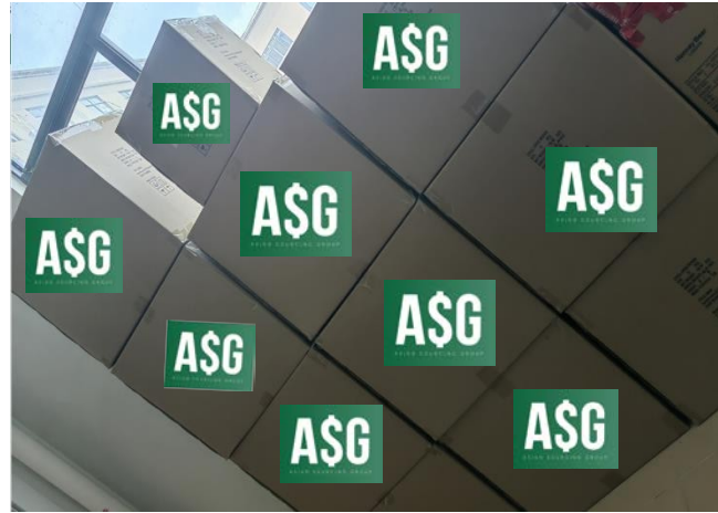
001 goods ready