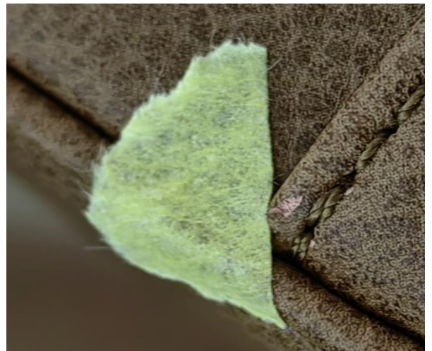
025-defect-pu damage on surface