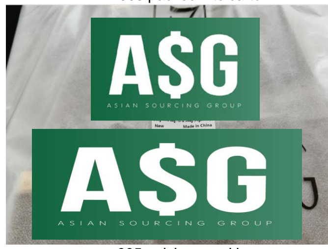
005 polybag marking