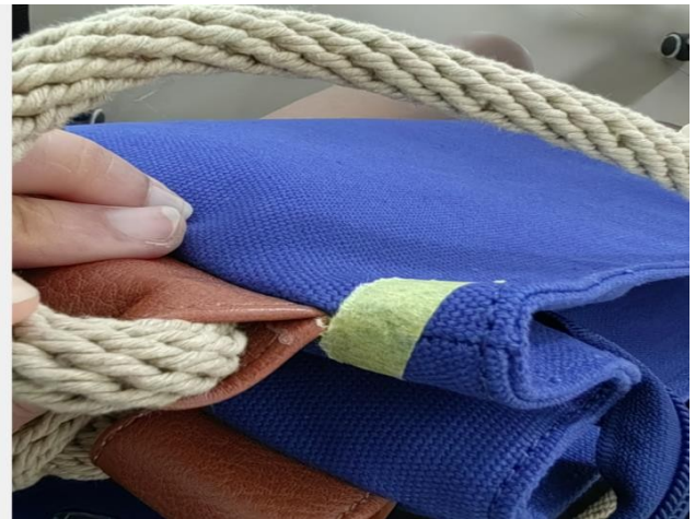
031 - defect-PU damaged on surface