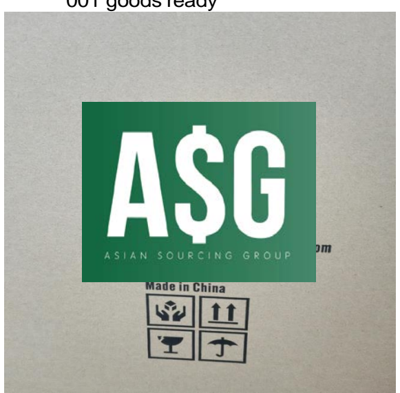
003 carton label