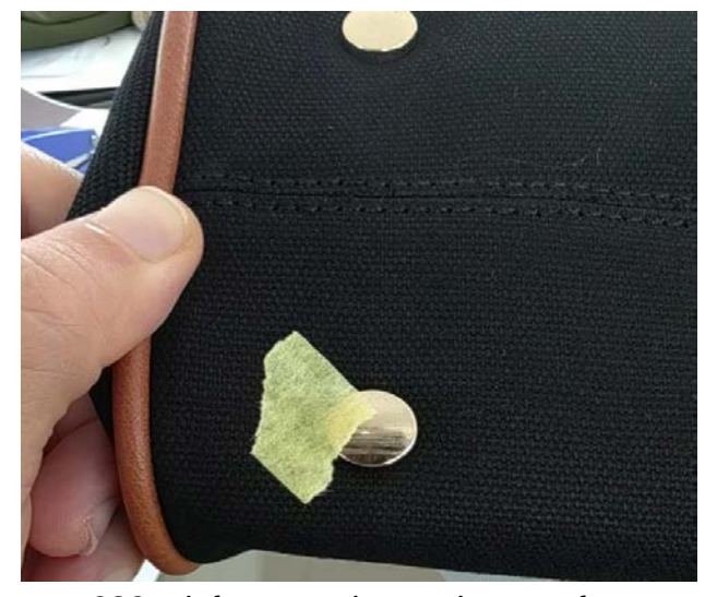
028- defect-metal scratch on surface