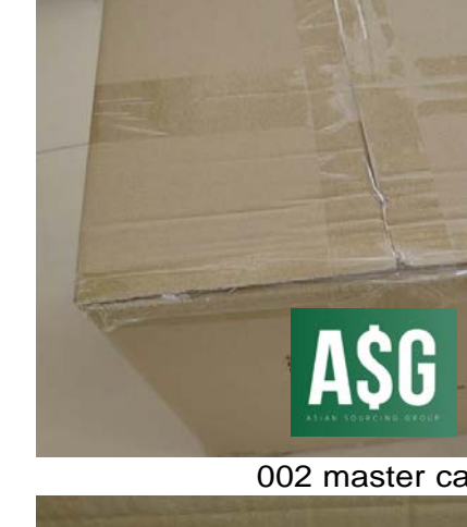
002 master carton view