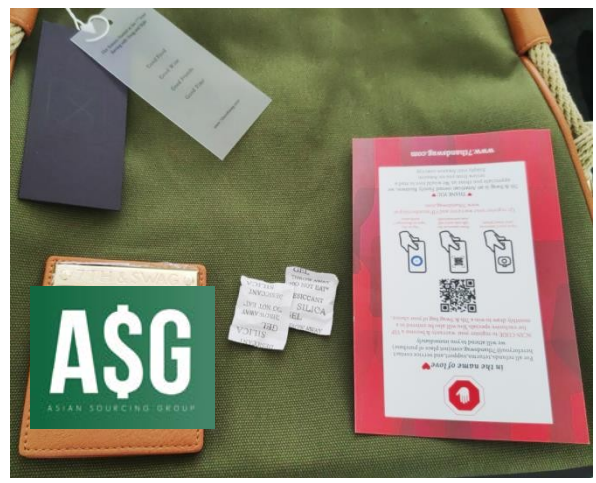
011 instruction card&hangtag