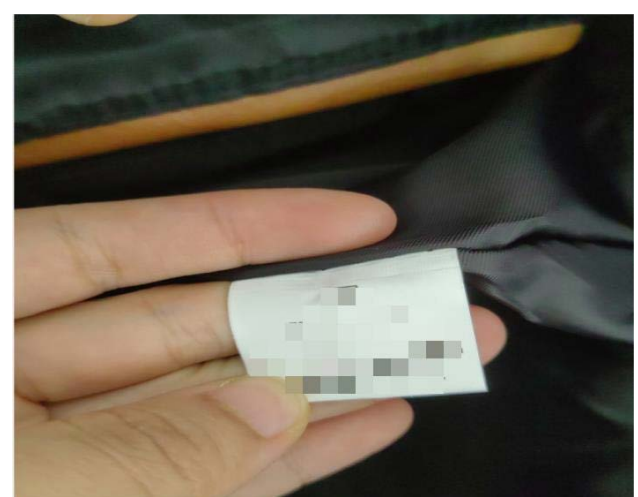
019 composition label